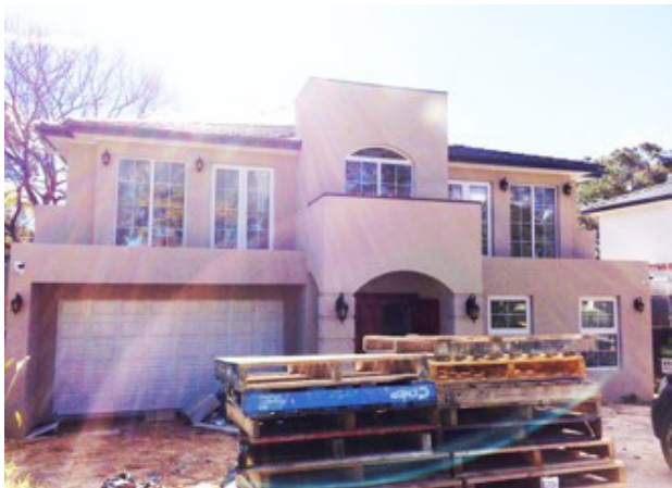
2017, Chatswood, NSW Representative: Louis Theofilopoulos

Melgrand mouldings were the essential value provider: they tie the different parts of the façade together giving the exterior of the house vitality and interest.