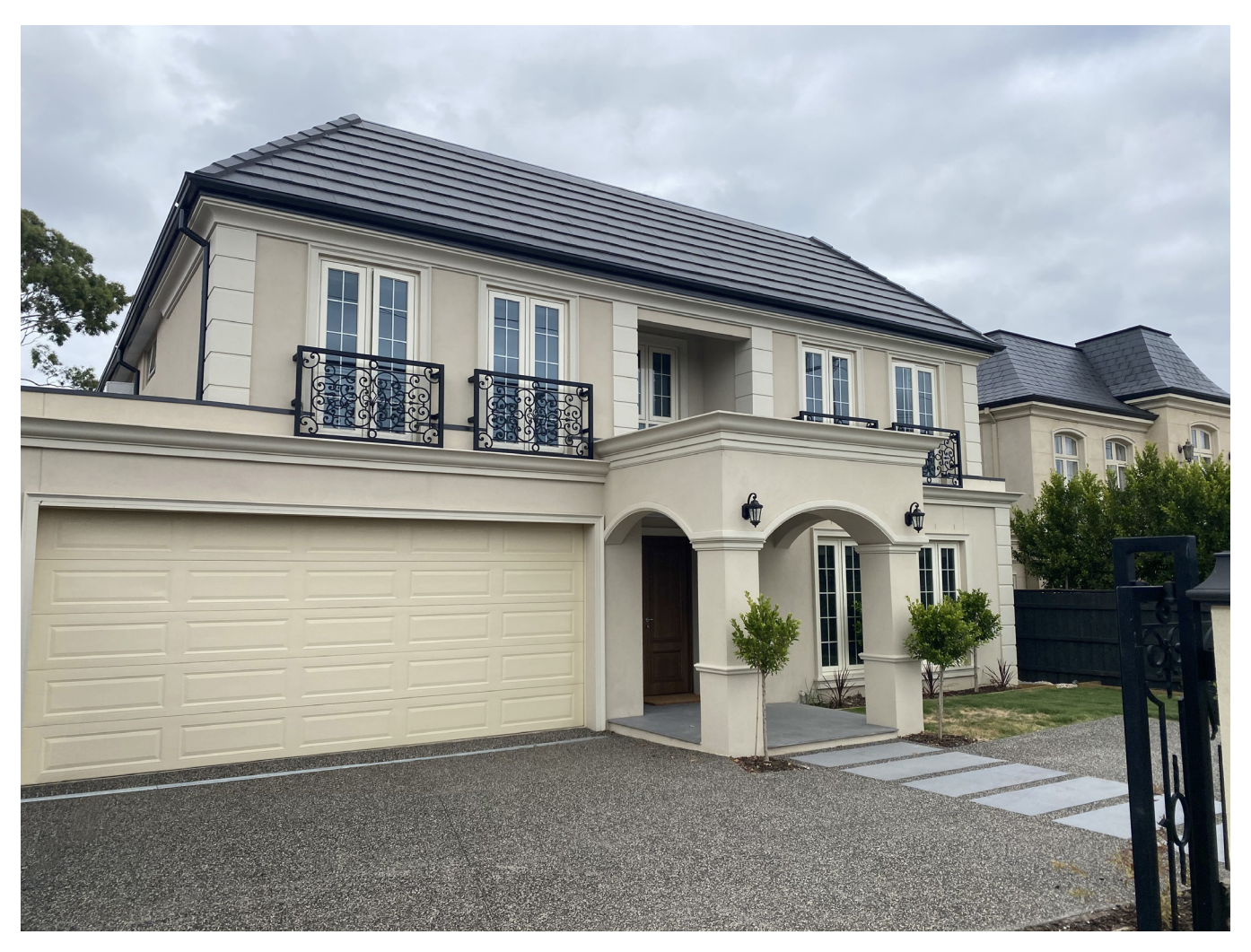
2019, Balwyn North, VIC

Melgrand mouldings transformed this modern building into a traditional home by helping to create a façade composition denoting each part in a harmonious whole. The front entrance is emphasized by discrete band and astragal mouldings and minor cornice sections. Nothing is out of place.