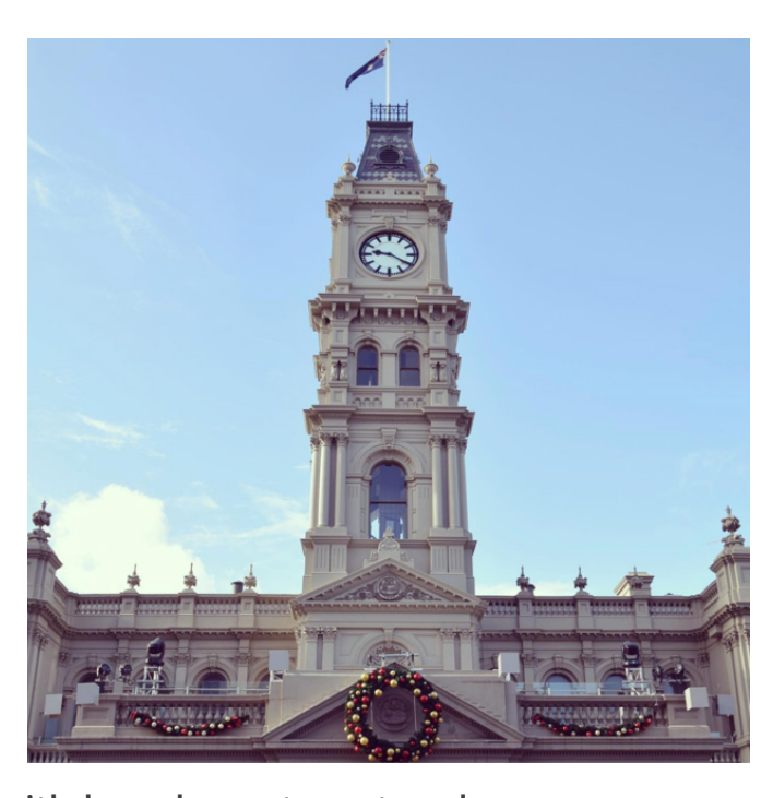
The Hawthorn Arts Centre was upgraded with key elements restored in 1995.