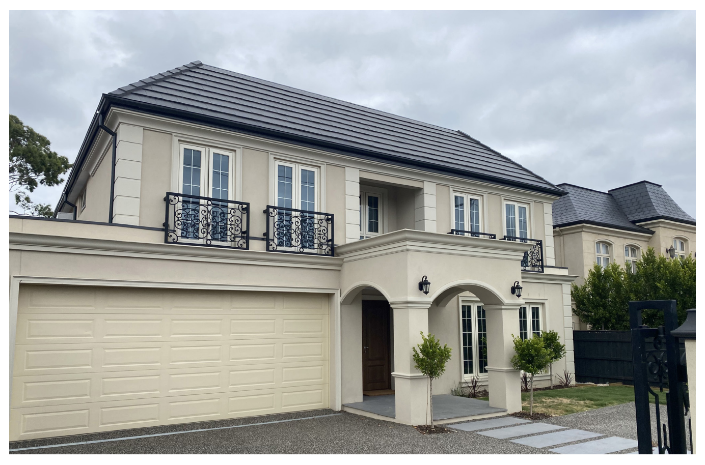
2019, Strathfield, NSW Representative: Louis Theofilopoulos

Clever application of panelled pilaster forms astragal bands and relatively simple window surrounds have transformed this building in suburban Sydney into a home with traditional references.